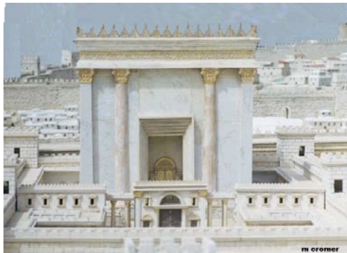
Herod's Temple, the way it Looked When Jesus was Here