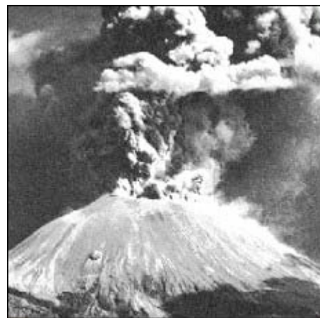
Vesuvius erupts in 1944

Tons of falling debris filled the streets until nothing remained to be seen of the once thriving communities. The cities remained buried and undiscovered for almost 1500 years until excavation began in 1748. These excavations continue today and provide insight into life during the Roman Empire.