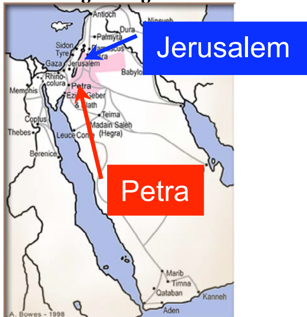
Map of Petra in Jordan

When he enters the new temple in Israel, and announces he is god, this will be Israel's signal to get out of Israel and flee to Edom, know to us today as "Petra"