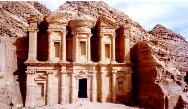
The Temple at Petra