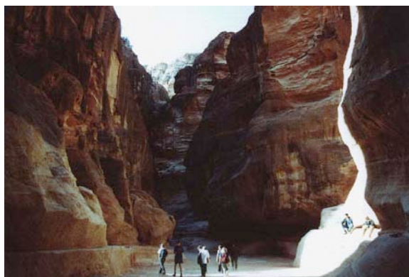
Entrance to Petra