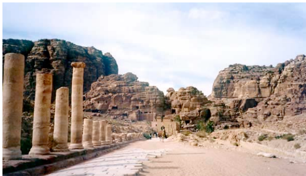
Roman Road at Petra

At the beginning, here in 2 Thessalonians, Israel will be deceived and believe that he is their long awaited Messiah.